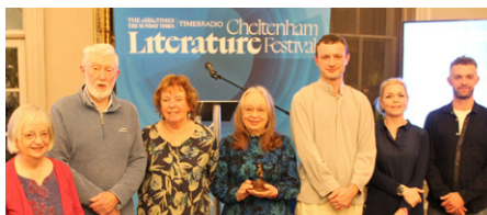
GLOS WRITERS' NETWORK WINNERS AND RUNNERS UP