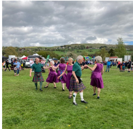
SCOTTISH COUNTRY DANCING

A typical demonstration aims to showcase the best of Scottish country dancing and to give the audience an idea of the range of the dances we enjoy. Scottish country dancing grew out of a merger between the English dancing style of the 18th century and the Scottish tradition of dancing reels. There are thousands of listed dances, with new dances being added each year, so a demonstration will include traditional as well as modern dances. We also include dances with different tempos, from the lively jigs and reels to the more stately, slower strathspey which is unique to this form of dance. Of course, there can be no dancing without music and there is a wealth of Scottish tunes associated with Scottish country dances – dancing to the sound of fiddle and accordion is a delight - and very