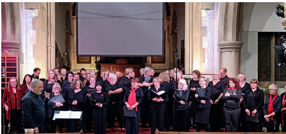
TAPESTRY CHAMBER CHOIR CONCERT